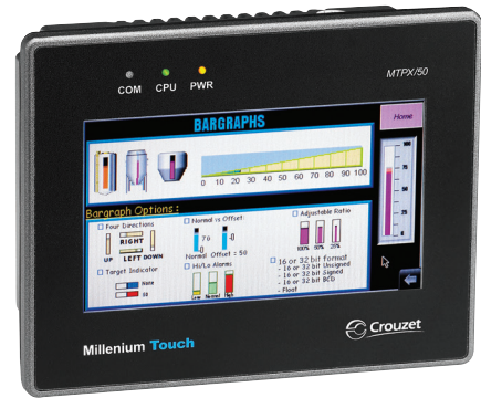
Programmable touch panel MTP6/50