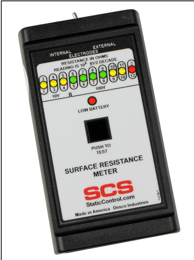
Figure 1. SCS SRMETER2