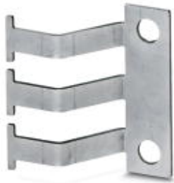
EMC cable catch rail

Please be informed that the data shown in this PDF Document is generated from our Online Catalog. Please find the complete data in the user's documentation. Our General Terms of Use for Downloads are valid ( http://phoenixcontact.com/download )